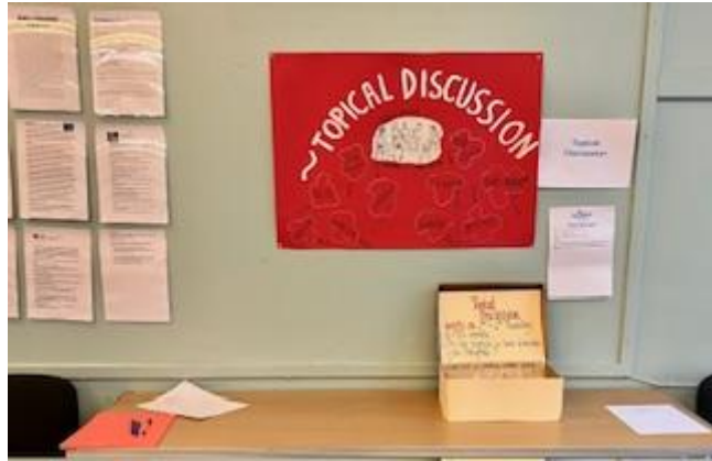
Topical Discussion Group's display

(if you dipped your hand into the box below the red poster, you could pull out a piece of paper with a topic for discussion written on it)