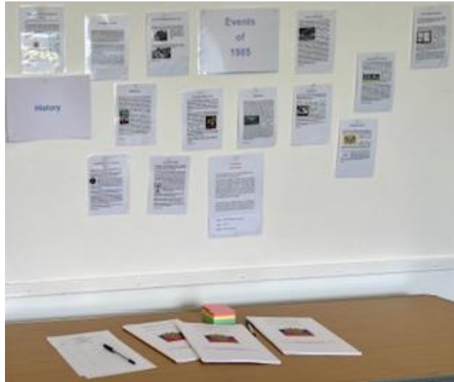
History Group's display