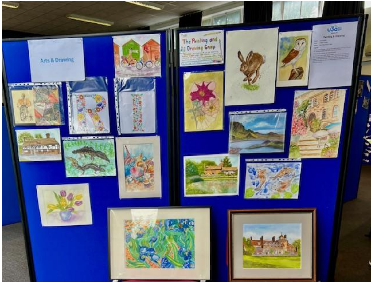
Part of Painting & Drawing Group's display