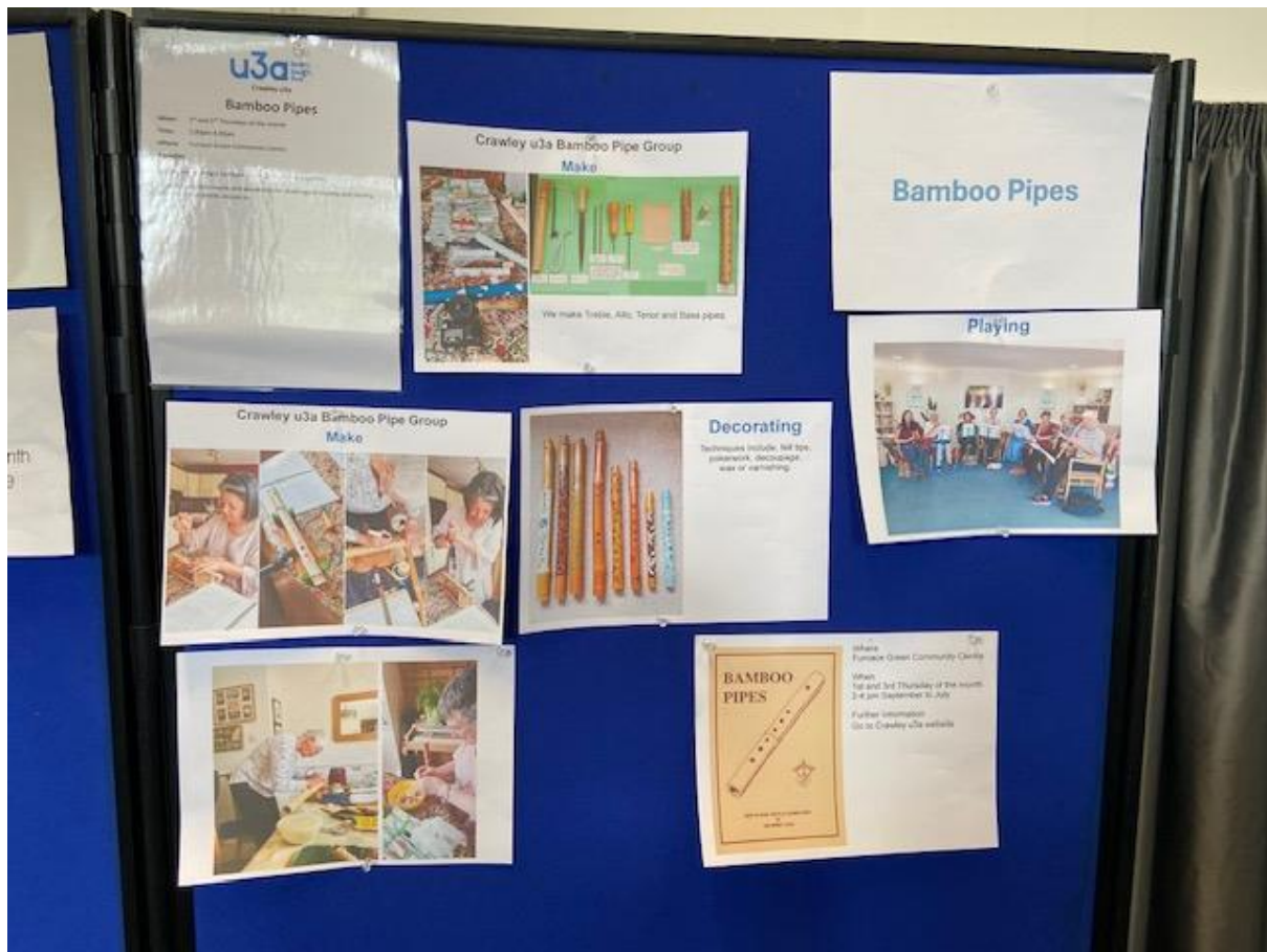
Bamboo Pipes Group's display