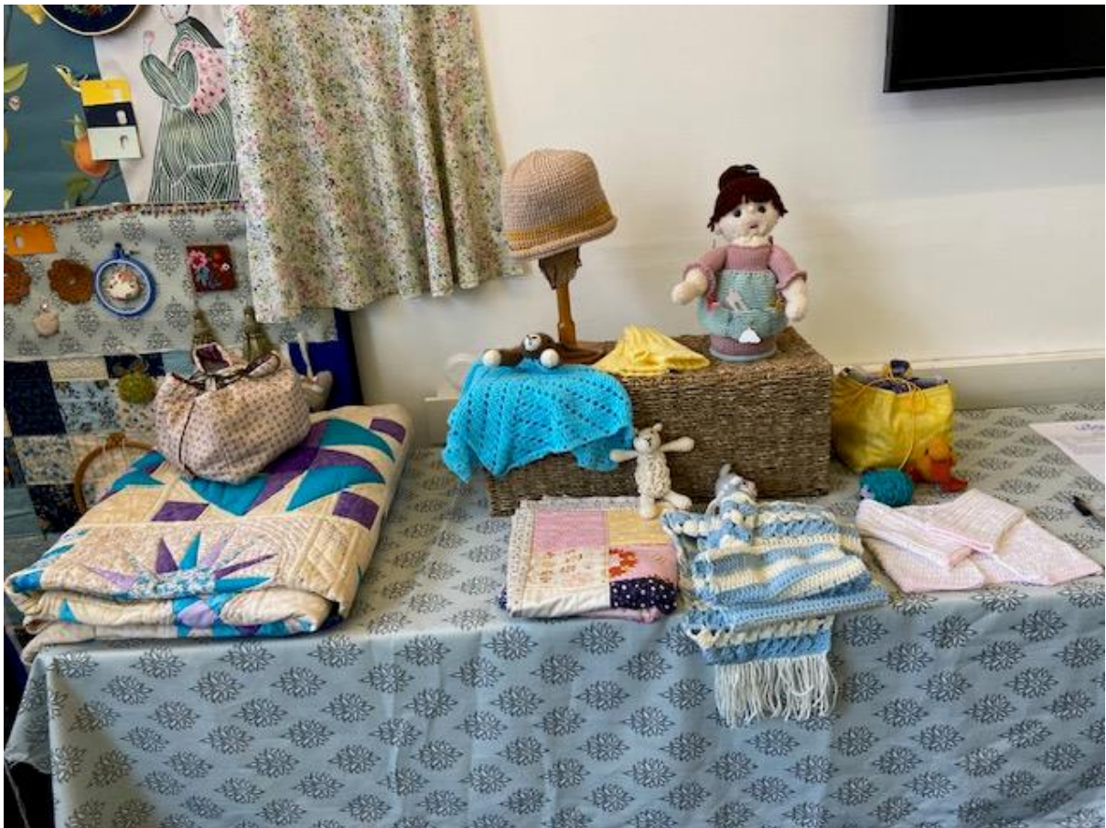
A close up of part of the Needles Group's display