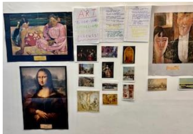
Art Appreciation Groups' display