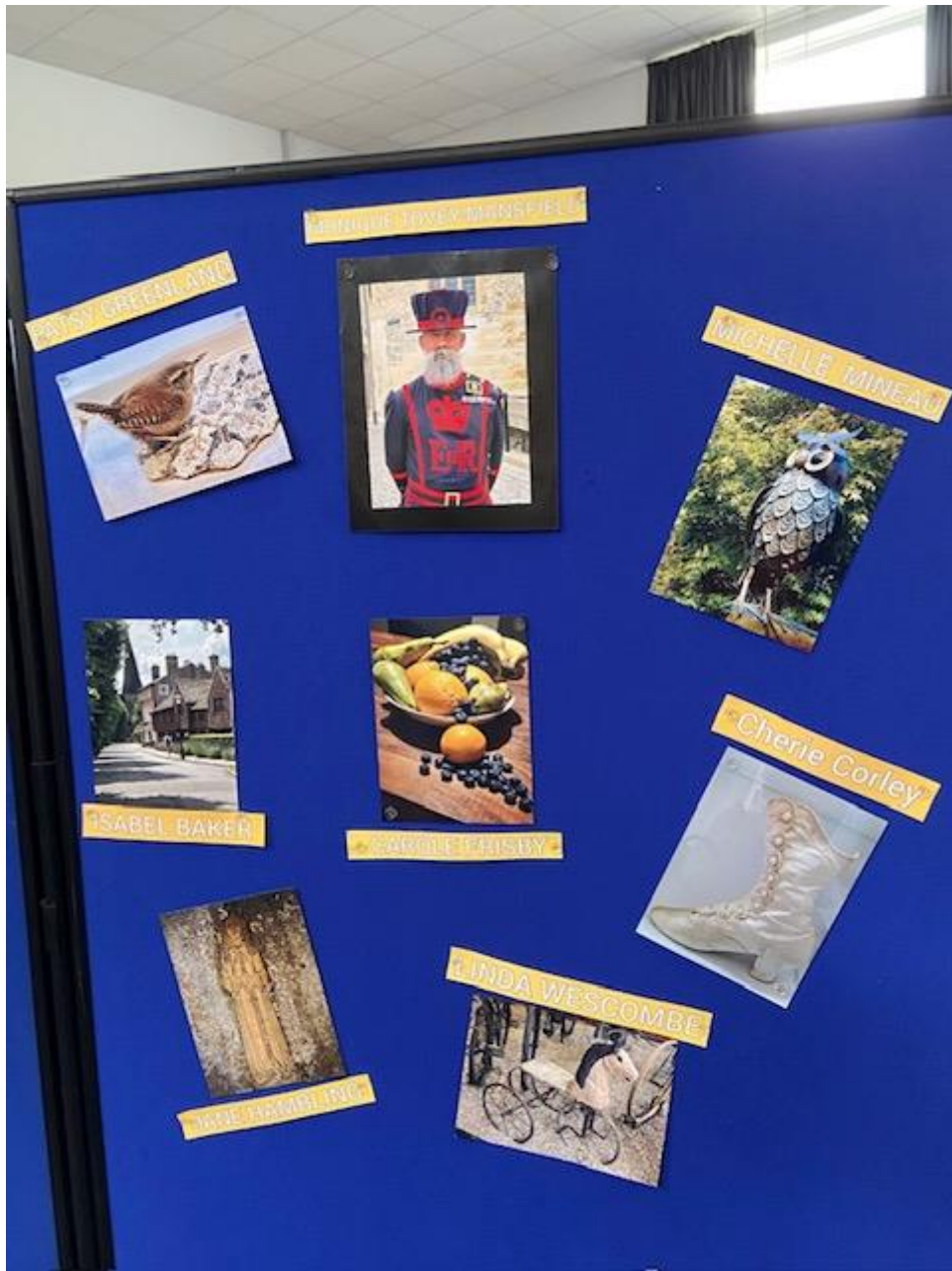
Part of Smartphone Photographic's display

Photos of the performances in the Ashurst Hall can be found on page 16.