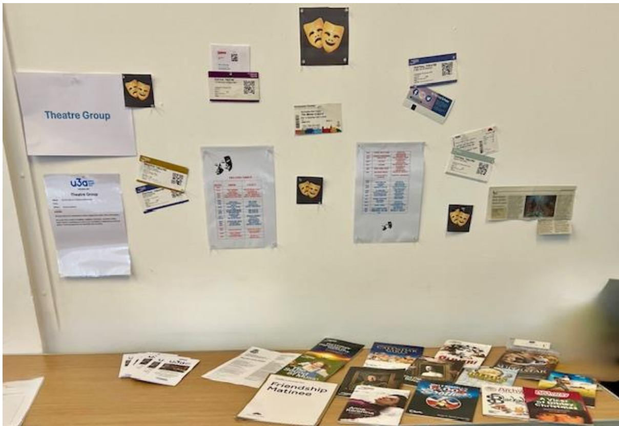
Theatre Group's display