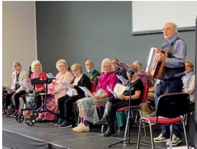
Folk Music Group