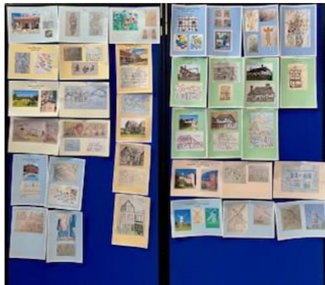
Part of Urban Sketching Group's display