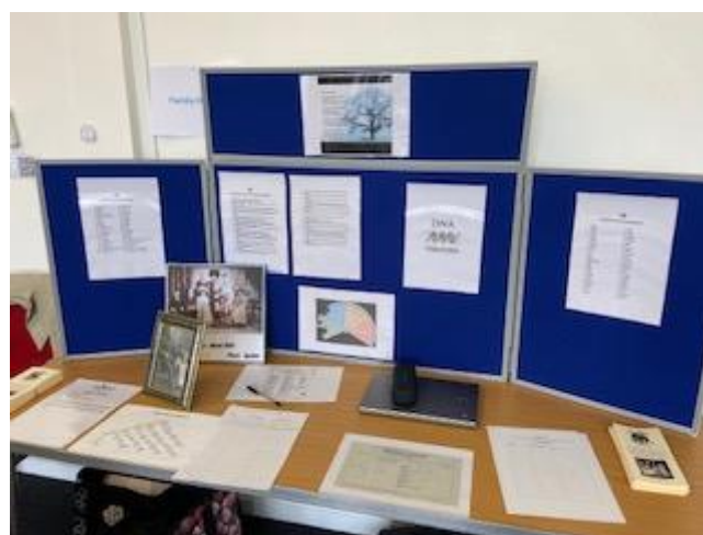
Family History Group's display