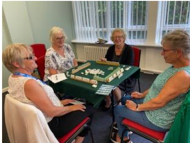
Mah Jong Group in the Games Room

In the Games Room it was possible to try your hand at Bridge, Chess, Mah Jong and Rummikub and Canasta.