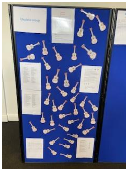
Ukulele Group's display