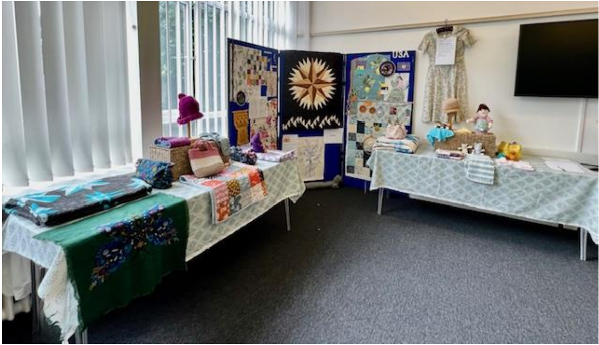
Needles Group's display