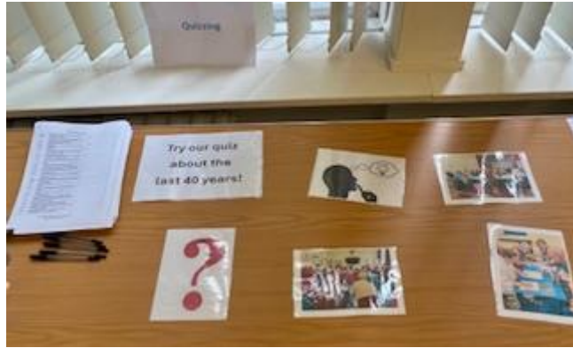
Quiz groups' display