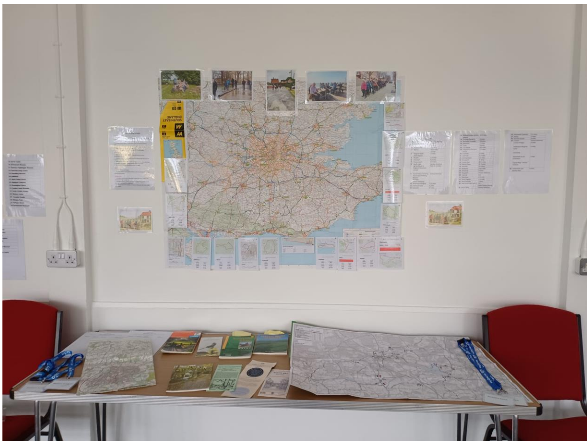
Top: Map showing locations of Out & About Groups' visits