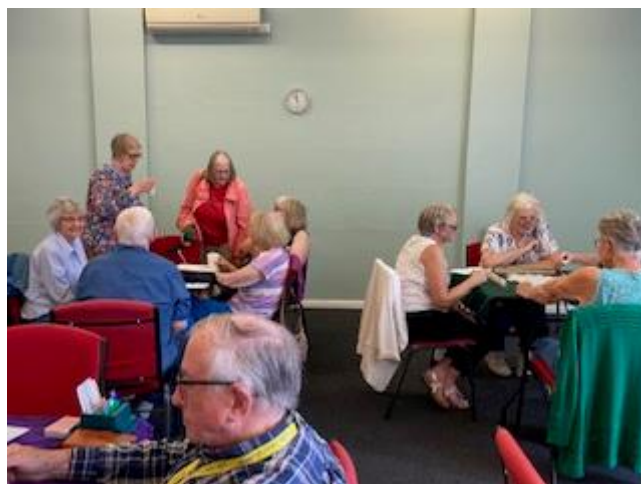
Rummikub & Canasta Group back left