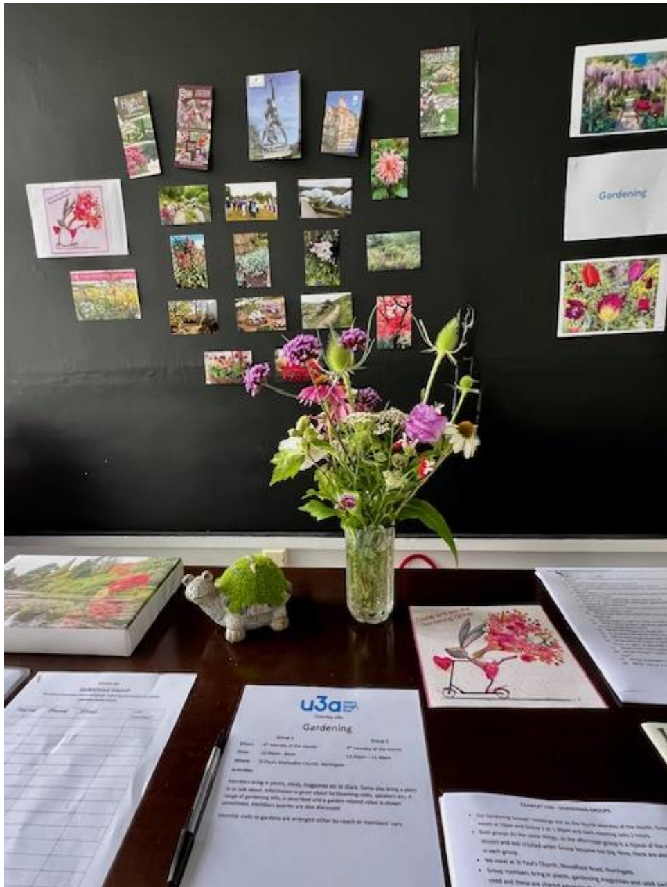
Gardening Groups' display